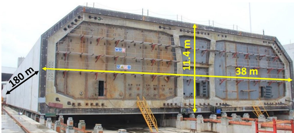
Fig. 1 – View and dimensions of tunnel precast segments of Hong Kong – Zhuhai – Macao link

This real case refers to non-destructive measurements of air-permeability kT and cover thickness d (also of electrical resistivity \rho , not discussed here) on the monumental precast sections of the submerged tunnel (see Fig. 1). These segments were built on land and later floated to be towed and sunk at their precise positions. The durability requirements for the construction of the segments are described in Table 1.